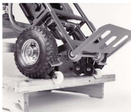
LIFTKAR braked at the step margin