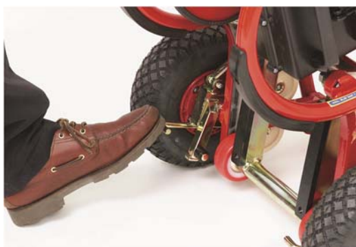
by foot (push hard)