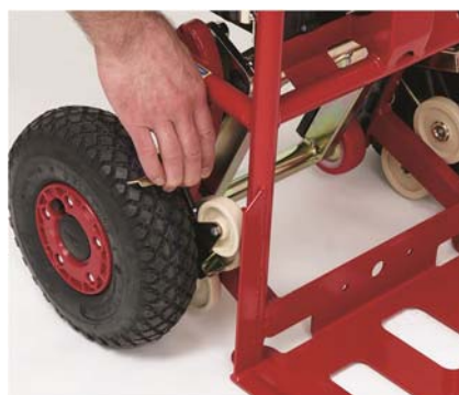
or by hand

Important: minimum tyre pressure 2.5 bar because of ground clearance.