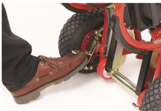
Push up the handle

Switching on the step margin-brake from the neutral position: